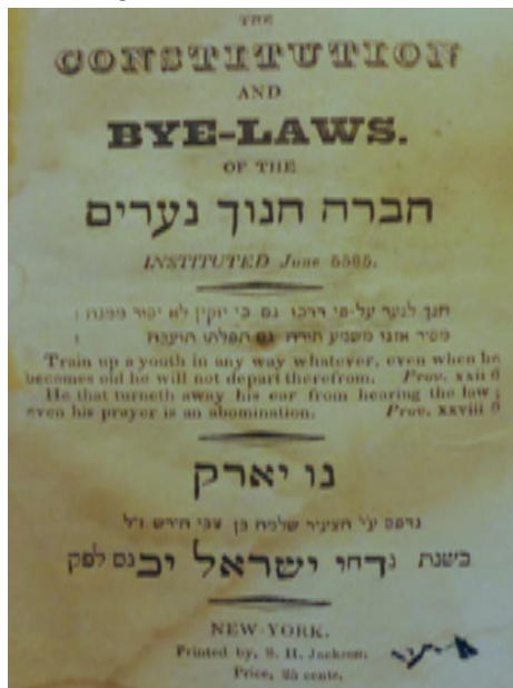
Title Page: חברה חנוך נערים, The Society for the Education of the Children

Now let us shift our attention to a troubling story in Sefer Bamidbar.